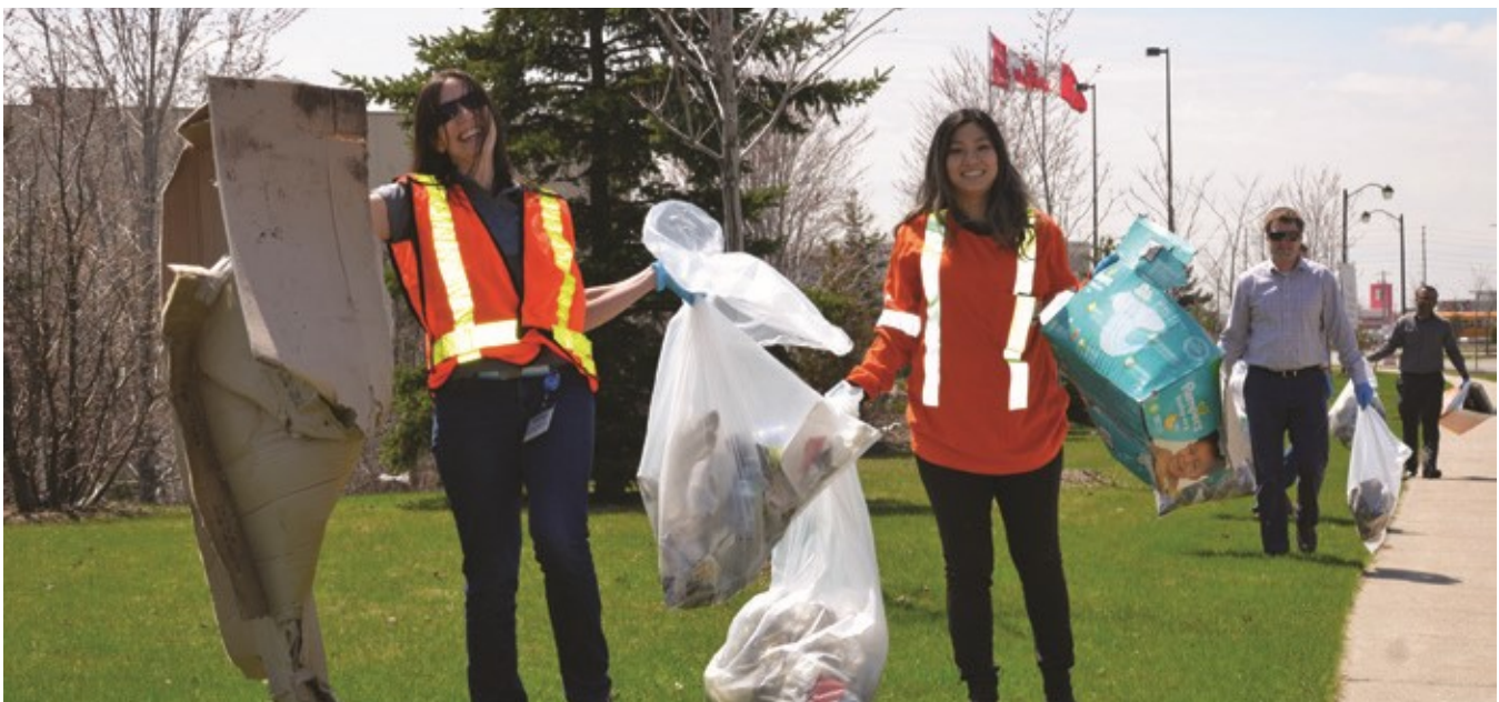
Alectra employees used their lunch break to clean up litter in support of the City of Vaughan's 20 Minute Makeover program.

Serving more than one million homes and businesses in Ontario's Greater Golden Horseshoe area, Alectra Utilities is now the largest municipally-owned electric utility in Canada, based on the total number of customers served. We contribute to the economic growth and vibrancy of the 17 communities we serve by investing in essential energy infrastructure, delivering a safe and reliable supply of electricity, and providing innovative energy solutions. Our mission is to be an energy ally, helping our customers and the communities we serve to discover the possibilities of tomorrow's energy future.