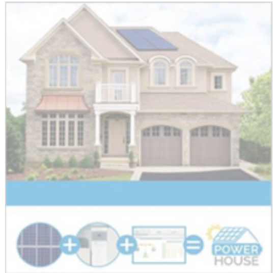
This illustration shows how the POWER.HOUSE™ virtual power plant works, including the networking of 20 houses in York Region to demonstrate the pilot’s grid-support potential and addresses the sector’s questions about sustainability, scalability and affordability.

Alectra's POWER.HOUSE™ pilot enables customers to generate their own clean, renewable energy and store it in case of an outage. It gives consumers more control over when and how much power they consume and provides them with an on-bill credit for feeding energy back into the power grid. By treating the cluster of 20 homes in the pilot as a single “virtual power plant,” the solution positions Alectra to ensure consumers’ homes use energy efficiently, to manage demand response requests from the provincial system operator effectively, and to provide power outage support when required.